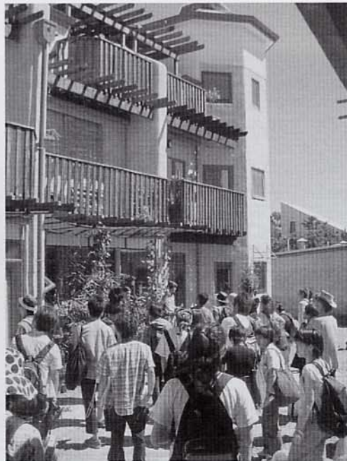
Plate CS6: Christie Walk, Adelaide, Australia.